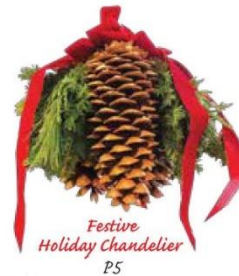
Festive Holiday Chandelier P5