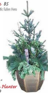
32" Evergreen Planter B9