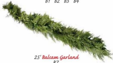
25' Balsam Garland B7