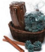
Fire Starter Basket P8

B Products primarily for outdoor use. P Products primarily for indoor and outdoor use.