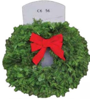
26" Fallen Hero Wreath Donation B5 Delivered to a National Cemetery to Honor our Veterans No Specific Fallen Hero