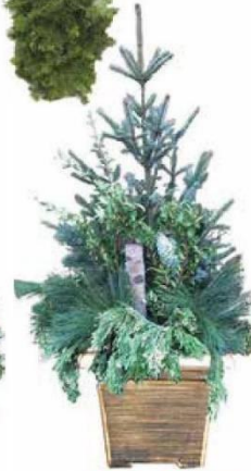
42" Evergreen Planter B10