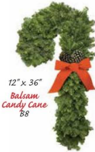
12" x 36" Balsam Candy Cane B8