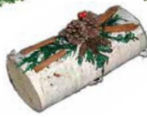
12" Holiday Yule Log P7