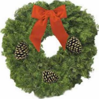
Balsam Wreath 26", 36", 48", 60" B1 B2 B3 B4