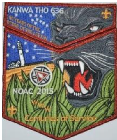
Not Individually Available